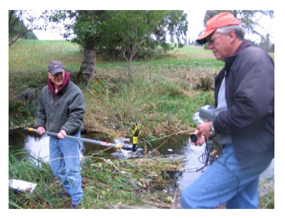
Skagit Stream Team