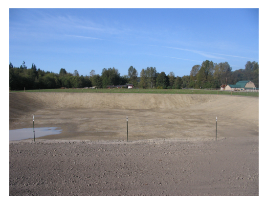
Waste storage pond