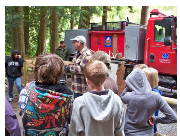
Sixth Grade Conservation Tour