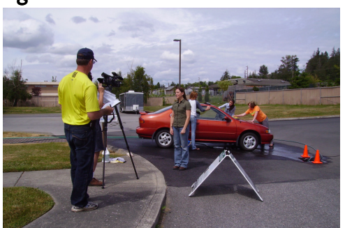
Making of the video