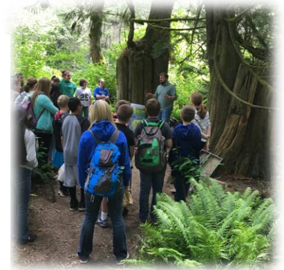
Youth Conservation Tour