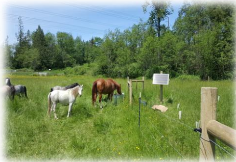
Solar Water Pump