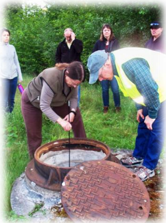
Detention Pond Maintenance Workshop