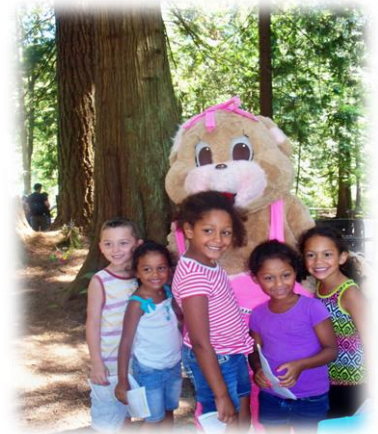
Blossom and Friends Kids in Nature Event