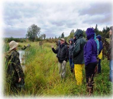
Stream Restoration Project WSM field trip