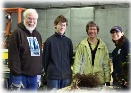
Native Plant Sale