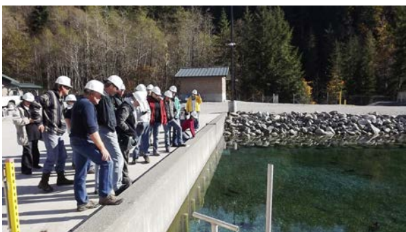
Figure 4 Fall 2013 Watershed Masters exploring Baker Dam and the sockeye spawning grounds.