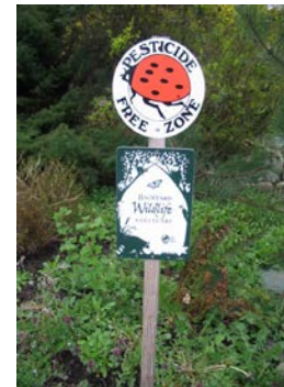
Figure 3 Inspired by the Backyard Conservation Stewardship program, signs like these are popping up throughout Skagit County – over 650 in Anacortes.