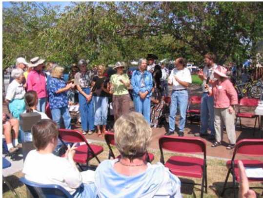
Figure 1 Fidalgo received national designation as a "Community Wildlife Habitat" in Aug. 2008. This was a grassroots effort lead and accomplished by volunteers (with continued support from SCD staff) from the 2005 & 2006 Backyard Conservation Stewardship Short Course.