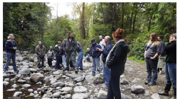
Figure 5 "Return of the Salmon" Watershed Masters field tour.