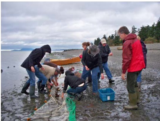
Figure 2 Fall 2014 Watershed Masters explore the estuary during a field tour at Bay View State Park.