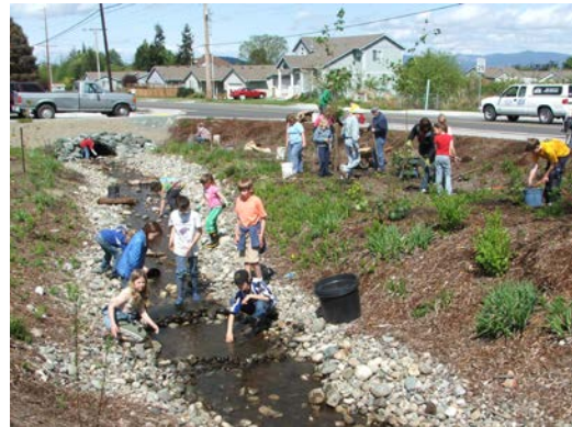
Figure 2 Backyard Conservation class participants have inspired numerous community projects to protect streams and wildlife. Pictured, the Ace of Hearts stream enhancement project was inspired and organized by Fidalgo Backyard Wildlife Habitat Group. Native plants and technical support provided by SCD.