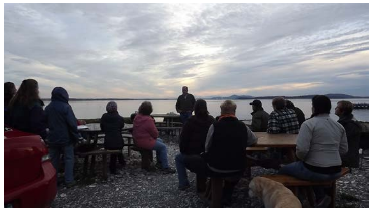
Figure 3 Fall 2013 Watershed Masters at Taylor Shellfish Farms for the annual shellfish, water quality and ocean acidification session.